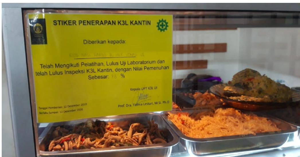
Figure 3. Certificates and stickers for the implementation of HSE in UI Canteen

The number of canteens that have gone through laboratory test is 91 canteens (30% of the total), and 35% of them (32 canteens) have passed the test and submitted a hygiene-worthy application to the Depok Health Center.