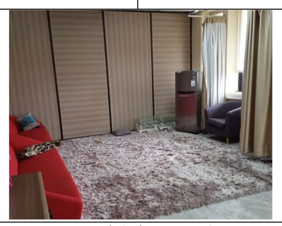
Lactation Room: facility for maternity and nursery