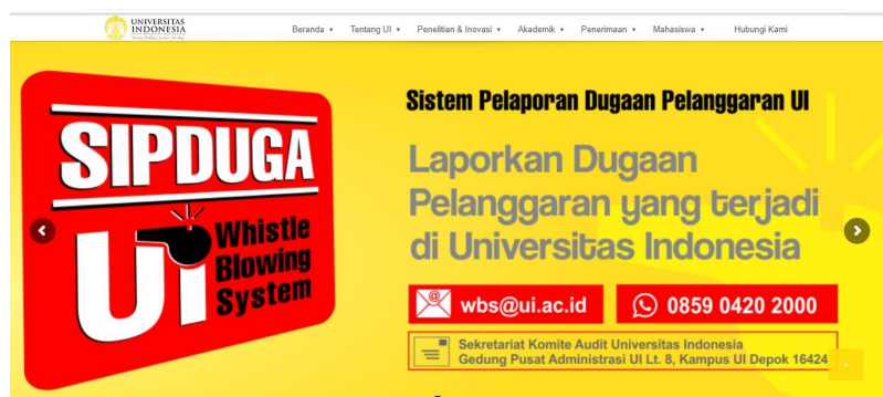
Whistle Blowing System Universitas Indonesia (WBS UI)