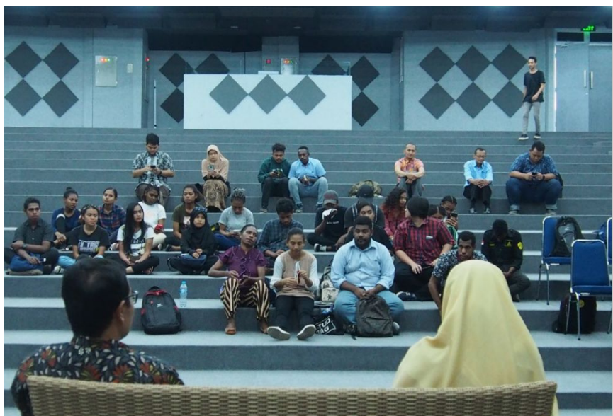
Event of Provision for Adapting to Early College Life and Academic for Adik Receivers in 2019