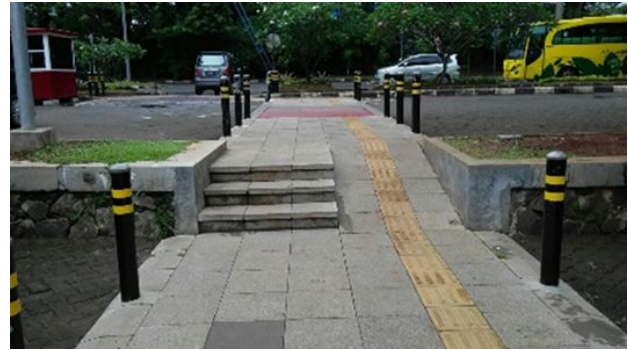
Special Street for Disabilities