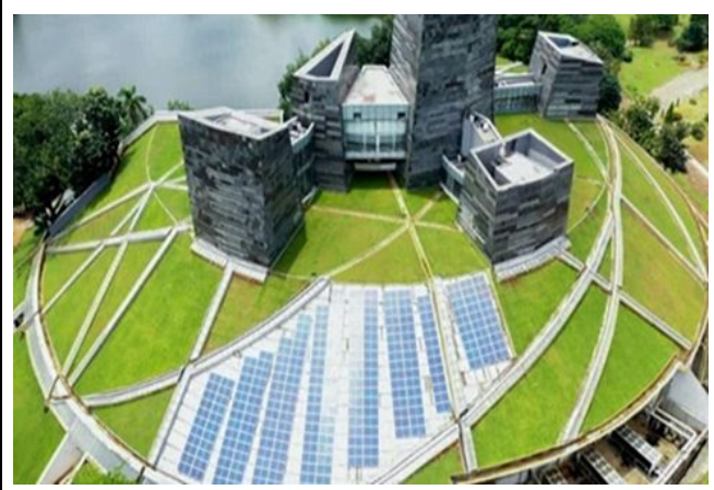
UI Library Building