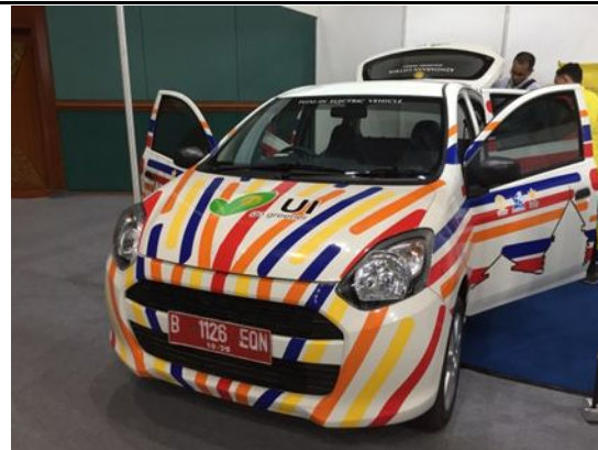
UI Electric Car