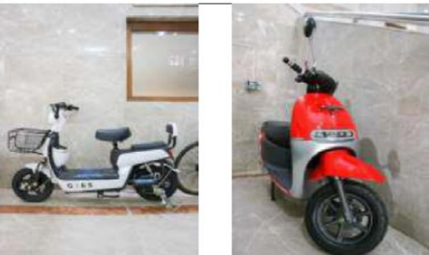
UI Electric Bike