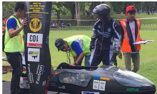
UI Fuel-Efficient Car