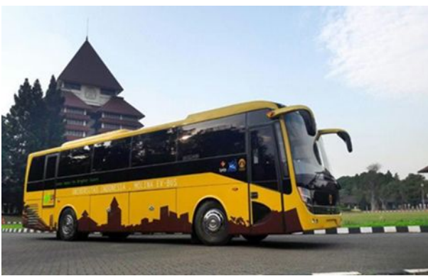
UI Electric Bus