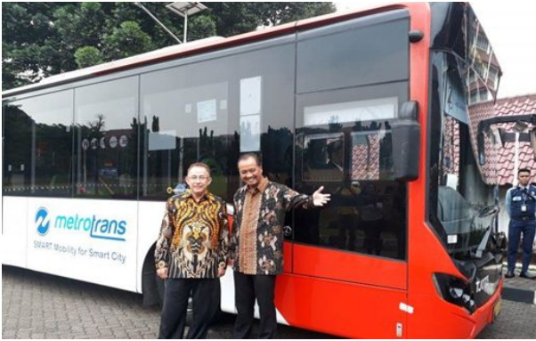
Cooperation with Transjakarta Busway Limited