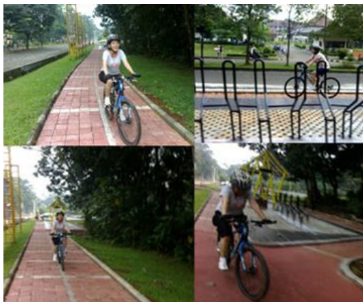
UI Bike Tracks