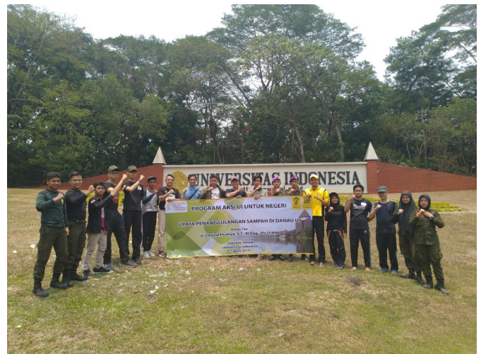
Clean Waste Action at UI's Lake