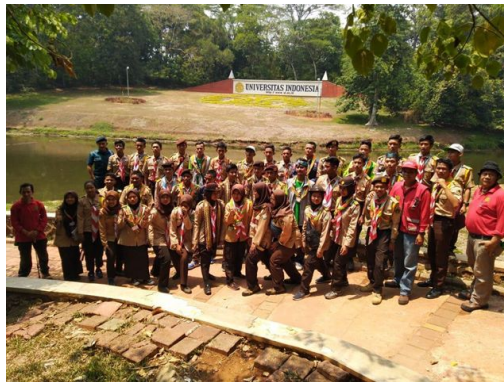
Tree planting, and environmental conservation activities around the UI lake