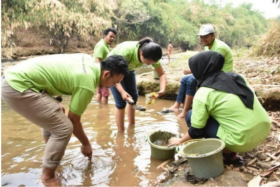
Vetiver nursery planting activities in Ciliwung River, Depok City