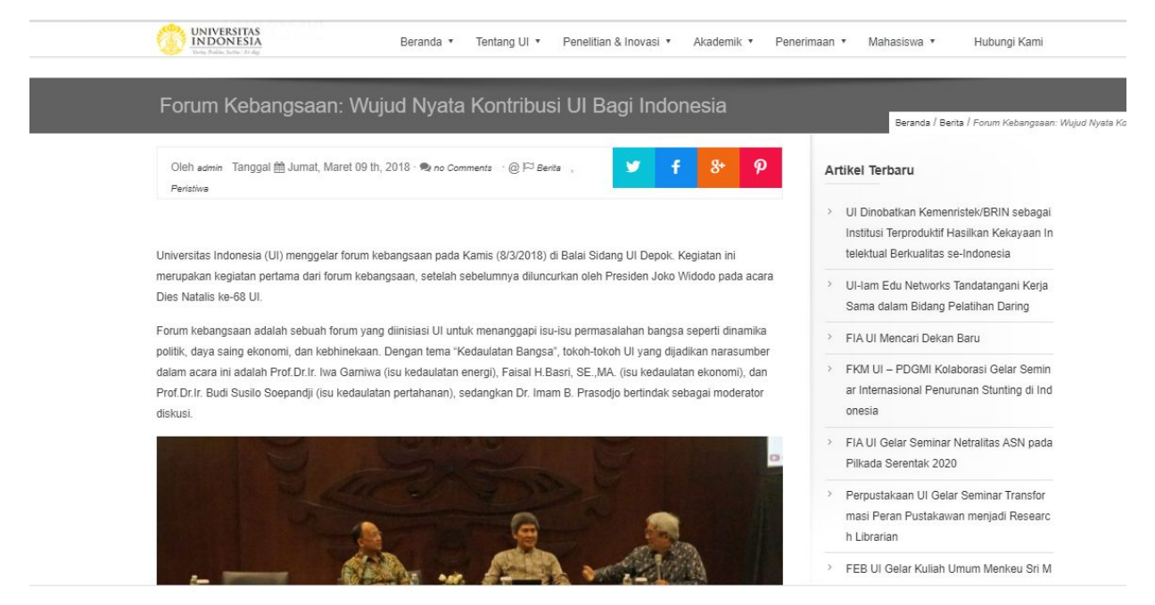
National Forum: A Real Form of UI's Contribution to Indonesia

[16.2.5] University principles on corruption and bribery